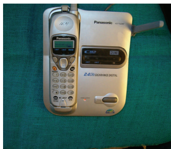
Integrate phones, PDAs and mobile devices with your alarm.