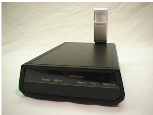
Table top Motion Detector

Most camera-based systems and systems that use the internet/ broadband have NO BATTERY BACKUP. They will fail when power is shutdown. Adding battery backup to all of your interent equipment is far too expensive and complicated. NetWatchman includes full battery backup