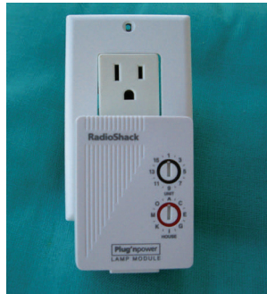
Radio Shack Automation Module—about $10

When you are away you might ask your alarm to