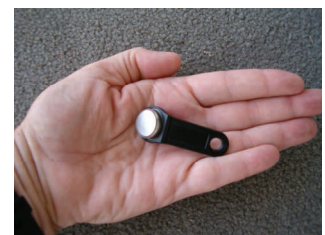
Handy fob provides simple control